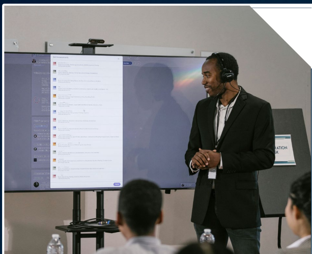
BUSINESS & ENGLISH TEACHING

Turning Dreams into Reality isn't just a slogan—it's the DNA that drives everything we do.