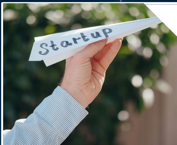
BUSINESS OPENING & SUPPORT